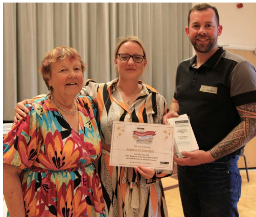
New Business of the Year – Ingersent Interiors

We were especially pleased to have received such wonderful positive feedback from residents and local groups who attended.