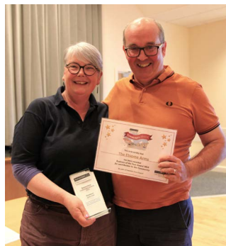
Business of the year - Etsome Arms