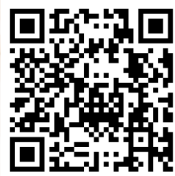
SCAN TO FIND OUT MORE

flowerpreservationworkshop@gmail.com www.flowerpreservationworkshop.co.uk