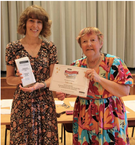
Community Group of the Year – Tots Life