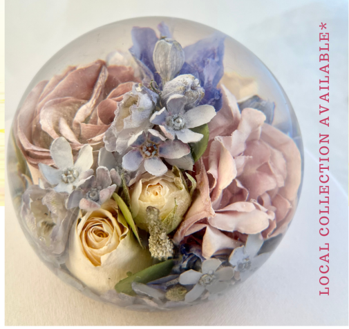
LOCAL COLLECTION AVAILABLE*