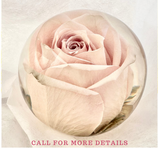
CALL FOR MORE DETAILS