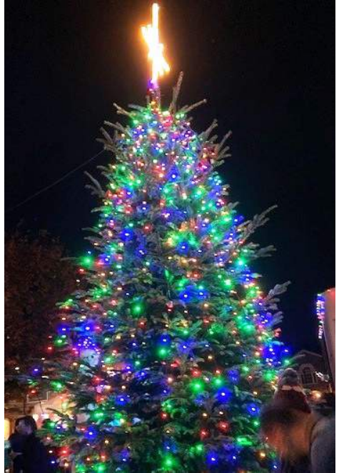
With thanks to Cllr Fletcher for her photo taken at the tree lighting on 3rd December 2023

If your tree is over 6ft or you do not subscribe to the garden waste collections, please take your tree to your local recycling centre. Please note that if your tree's trunk is over 6 inches in diameter this cannot be taken to the recycling centre.