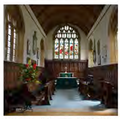
Somerton Church (St. Michael & All Angels)

Monday 25<sup>th</sup> December 10.00am Christmas Day Service with Holy Communion