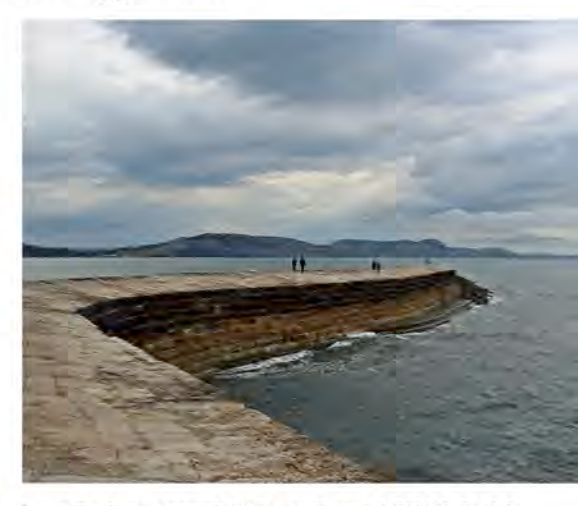
Lyme Regis

On 20<sup>th</sup> June, departing at 11.00am we're going to Lyme Regis for the day, tickets £11. On Friday 30<sup>th</sup> June we'll enjoy lasagne and desserts at our lovely Supper Evening, followed by a quiz and prizes. Come at 5.00pm, tickets are just £7. We think of all our supporters as friends and love to see you.