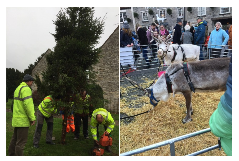
Viaduct No. 205 - November 2020