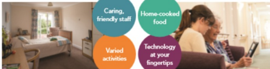
Wessex House, Behind Berry, Somerton TA11 7PB

We provide residential and nursing care in a safe, comfortable and welcoming environment. Whether you are interested in day care, short-term respite care or a long-term stay, get in touch with us now to arrange to come and look around.